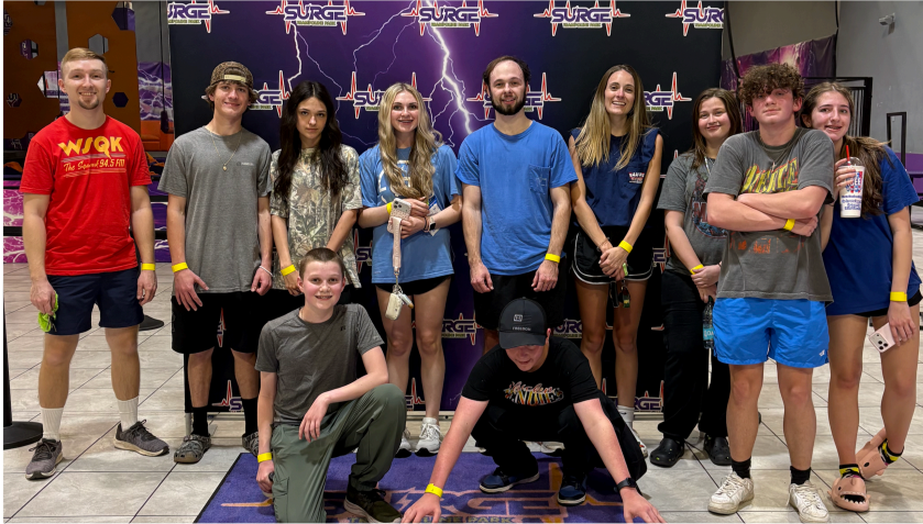
(This picture was taken at the Trampoline Park in March. We Praise the Lord for no broken bones!)